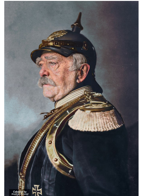
Otto Von Bismarck, 1871 ( http://www.marinamaral.com/blog-2/2016/5/22/otto-von-bismarck-1871 )

ence pricing system introduced in 2013. Although it may seem that patient rights and access to medicines has decreased by a higher demand for direct out-of-pocket co-payments the system enables sustainability and access to new healthcare technologies.